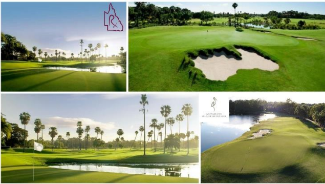
Monday 13 March Sanctuary Cove "The Palms"